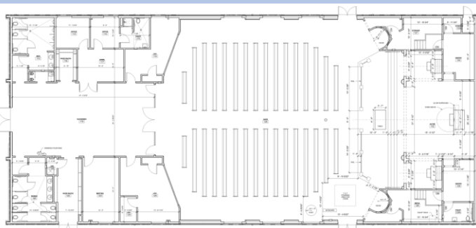
Church floor plan ( link )